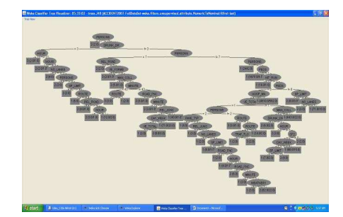
Figure 2: Generated Decision Tree from WEKA Tool

Preparing the Data and Selecting the Relevant Attribute